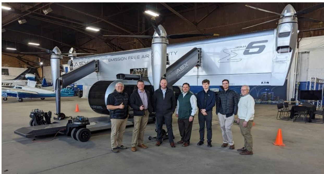
Project team members—from WSP, MDOT and ASX—in front of the advanced air mobility aircraft developed by ASX, WSP's partner on the Michigan communications mesh project.

Another factor will be emergency response. In the event of emergencies, a robust communications network can provide quick and effective communication to facilitate rapid response and coordination. When incorporating the transportation system of the future, a necessity will be multimodal integration with existing infrastructure. A comprehensive communications network can facilitate smooth incorporation into established aviation and air traffic control systems. Moreover, this network can enhance travel times and operational efficiencies by linking various modes of transportation, mitigating congestion through effective coordination. As AAM and UAS operations evolve and expand, a robust communications network must allow for scalability and be adaptable to accommodate new technology and increased operations.